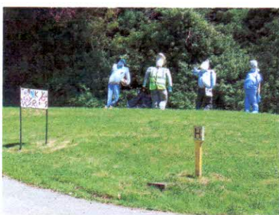
Scarecrows June 2020

Singers from Choir of St Peter's Nottingham have been working hard to keep choral music alive by creating 'virtual' performances of hymns, psalms and anthems for each week's online service, by combining recordings of each singer's individual part. This month (on the Royal School of Church Music's designated 'Music Sunday' – 14th June), the Choir released its most ambitious virtual performance yet in the form of Thomas Tallis's famous motet for 40 voices, Spem in alium . This infamously unwieldy piece is written for eight choirs, each of five voice parts and was improbably catapulted to fame in recent years by the book and film Fifty Shades of Grey . But well before then, Spem in alium has been the ultimate challenge in large-scale choral polyphony, with recordings released by all the major early music professional choirs. Though the well-known professional choir Stile Antico released a virtual performance of Spem in alium to commemorate the fortieth day of the lockdown, as far as they are aware, that from St Peter's is the only such performance created by a church choir. The recording, accompanied by images from around St Peter's Church can be found at https://www.youtube.com/watch?v=qPglGq7AnYA